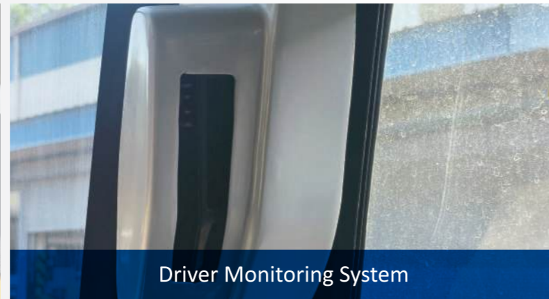
Driver Monitoring System