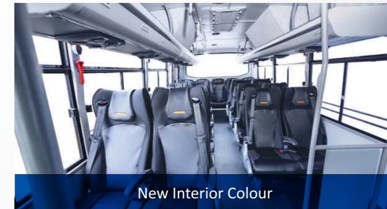
New Interior Colour