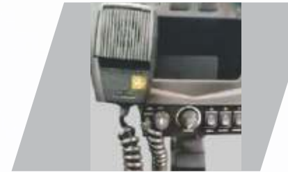
PA System with Mic