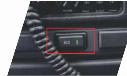
ECO & Power Switch for Better Mileage