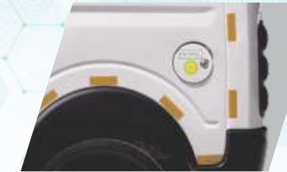
Lockable Fuel Filler Cap