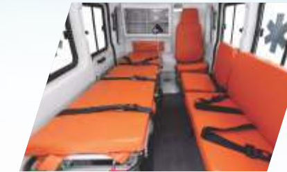
Flammability Resistant Interiors