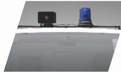
Siren & Revolving Lamp