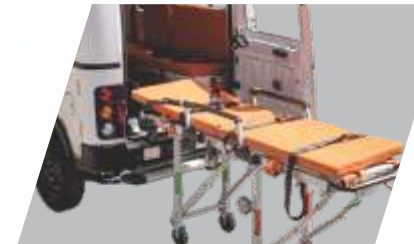
Auto Loading Stretcher