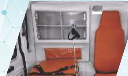
Oxygen Cylinder Mounting