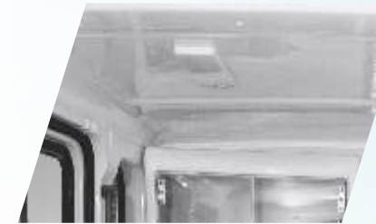
Lamps in Patient Compartment