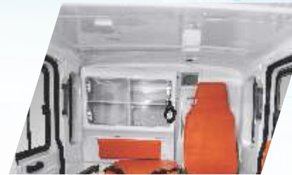
Patient Compartment Roof Paneling