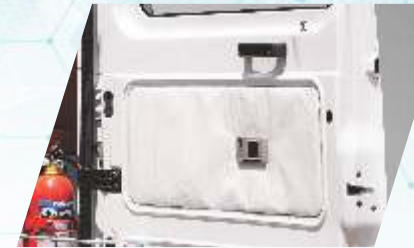
VFC Side Panels on Door & Side Walls