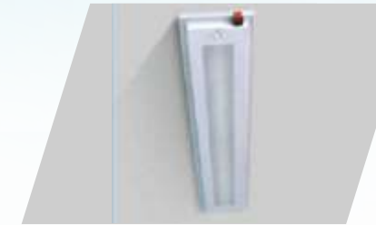
LED Roof Light