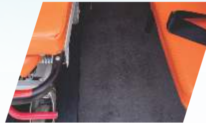
Antibacterial Floor Carpet