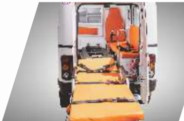
Auto Loading Stretcher

Three Attendants + 1 Doctor Seats | ECO/ Power Switch | Shell Variant also available | Most Spacious in Segment