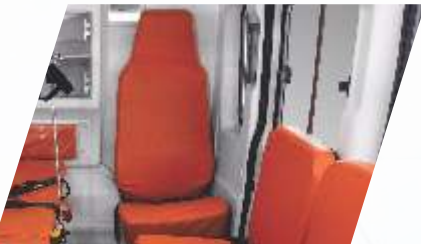
Individual Doctor Seat with Integrated Head Rest