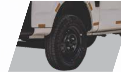
Low Rolling Resistance Tubeless Tyres