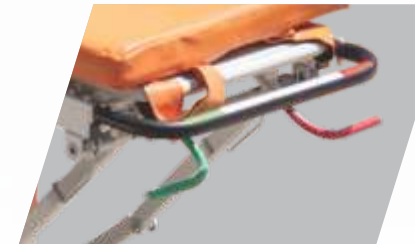
IV Hook Provision