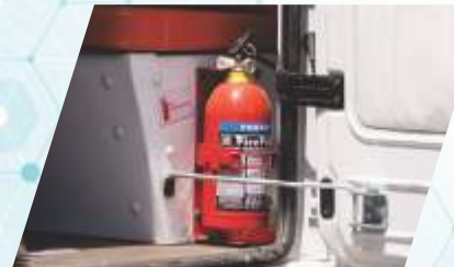
Stay Rod for Tail Gate