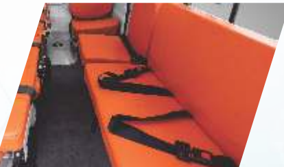
3-Seater Attendant Seats