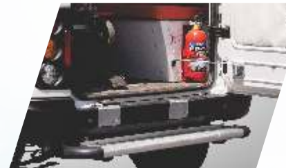
Tail Gate Footstep