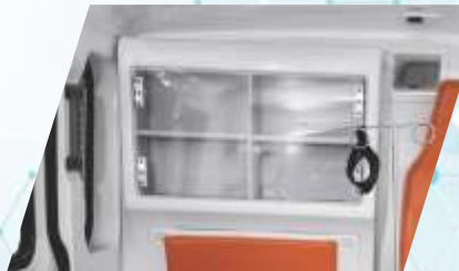
Medical Cabinet Box