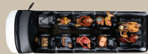
9-SEATER LUXURY VAN