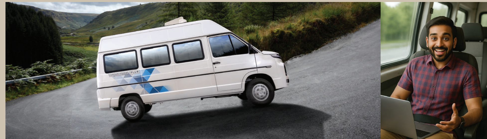
A comfortable journey uphill.